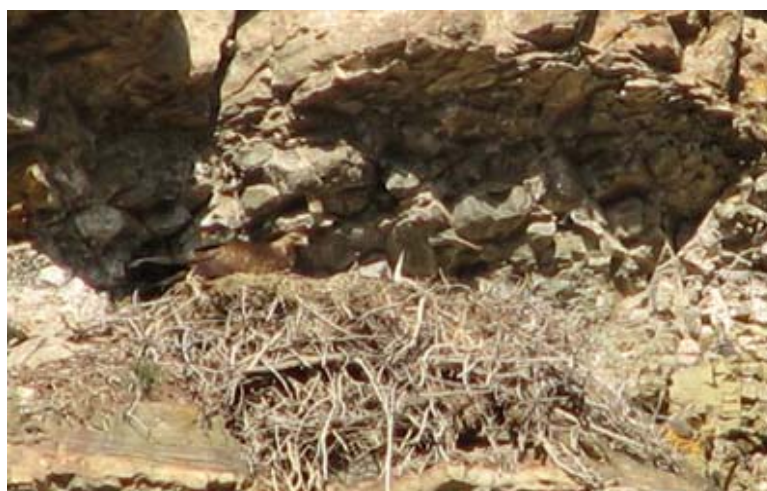
Figure 5. An adult Golden Eagle Aquila chrysaetos at nest, Aali'dareh core zone, Varjin, spring 2005, © D. Ashayeri.

management techniques and involvement of local people and should be set in a framework that reverses habitat fragmentation. Local people should also hold responsibilities for implementing conservation and protection regulations.