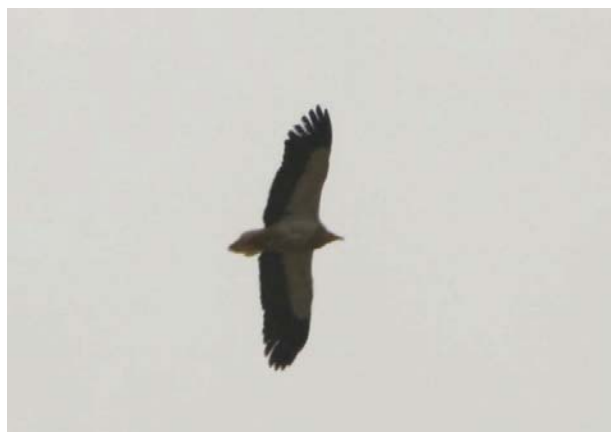
Figure 3. Egyptian Vulture Neophron percnopterus in the Varjin Protected Area, June 2007, © A. Ghoddousi.