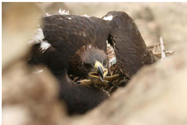
Figure 4. A nestling Golden Eagle Aquila chrysaetos at its nest, Varjin, spring 2007, © A. Ghoddousi.

The Varjin Protected Area is a critical habitat for breeding Lammergeier, Golden Eagle (Fig. 5) and Caspian Snowcock. A comprehensive conservation management plan should be developed, funded and implemented. The plan should emphasise practical wildlife