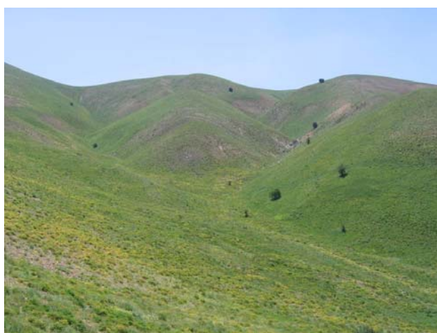
Figure 2. A view of the Chal-Agha Core Zone area, June 2006, © A. Ghoddousi.

species are permanent, 32 being endemic to Iran, and 45 species are domesticated. The VPA is an important reservoir of plant diversity (Yekom Engineers Co. unpubl. report).