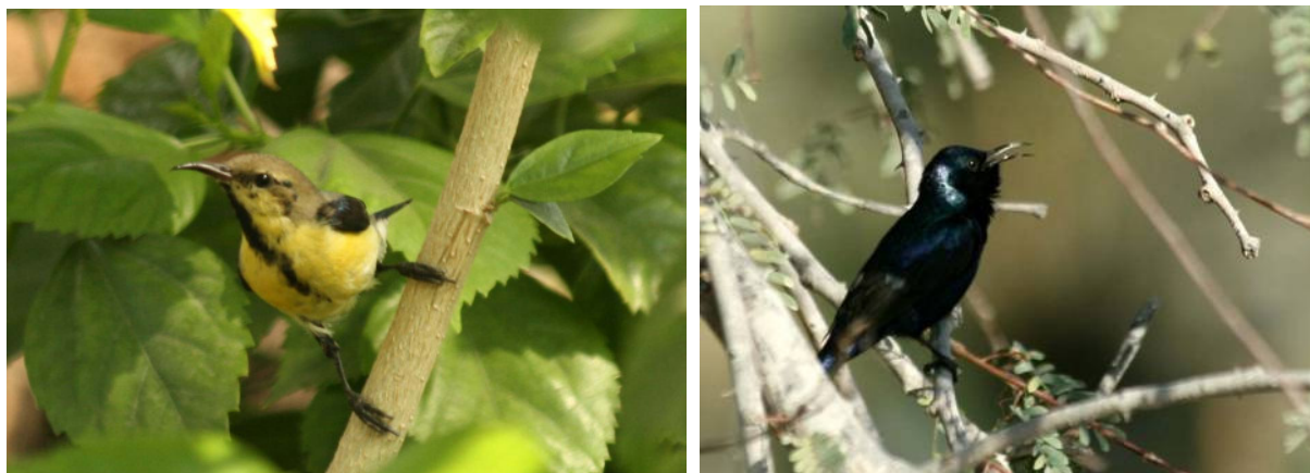
Figure 2. Male Purple Sunbird, Left ) in breeding season, Right ) pre-breeding plumage, © T. Ghadirian.

In Iran, the male plumage lacks any shiny black appearance in autumn. In November after the mating season, it has a light yellow breast and belly, a dark brown back and a dark line on the chin, throat and belly: this plumage remains through the winter season. After this plumage has moulted completely, in spring the male develops a shiny black appearance, but with violet and green to blue reflections around its head and neck (Fig. 2).